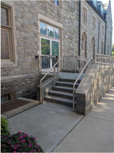
Accessible entrance on west side of building near passageway