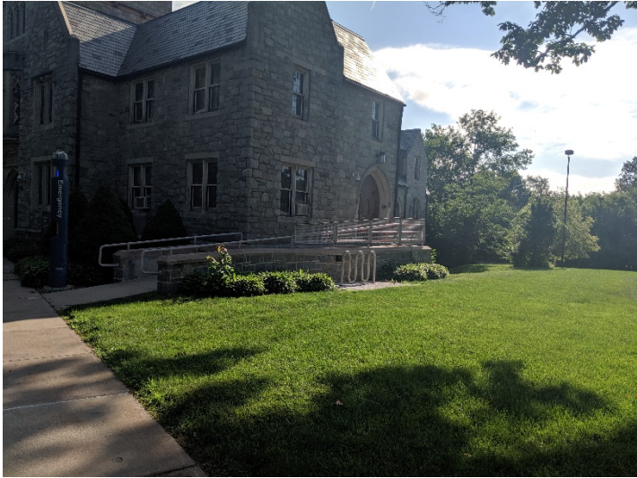
Accessible entrance on south side of building