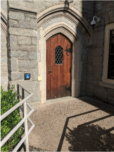
Accessible entrance located at intersection of the L-shaped building.