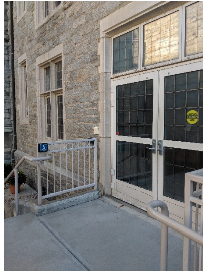
Accessible entrance on west side