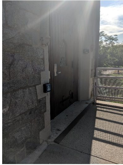
Accessible entrance on south side of building