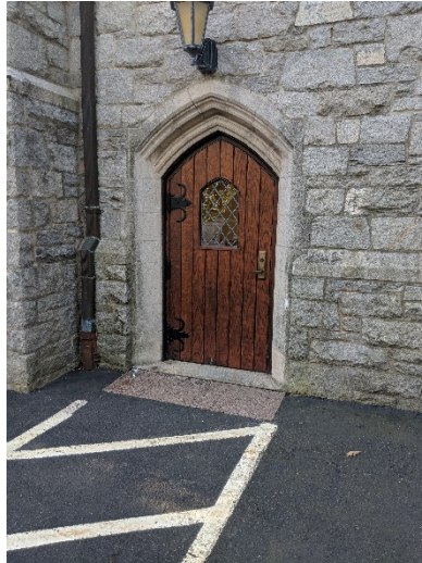
Accessible entrance on north side of building near parking.