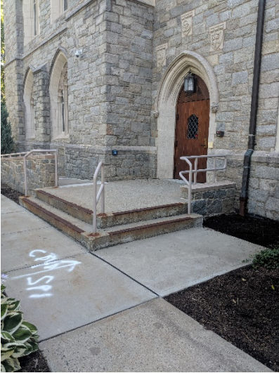
Accessible entrance on west side of building