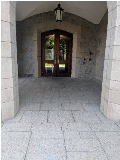
Accessible entrance on south side at main entrance.